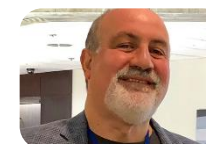
Dr. Nassim Taleb