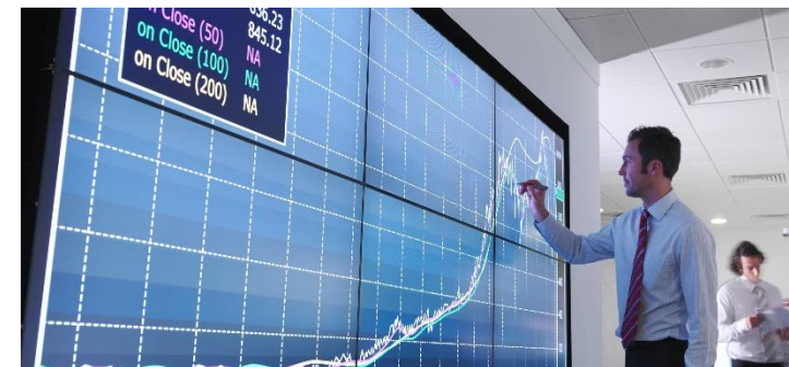
Careers Articles & Guides