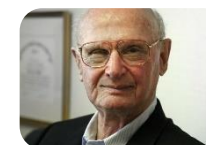
Nobel Laureate, Dr. Harry Markowitz