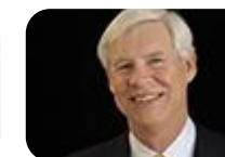
Nobel Laureate, Prof. Robert Engle